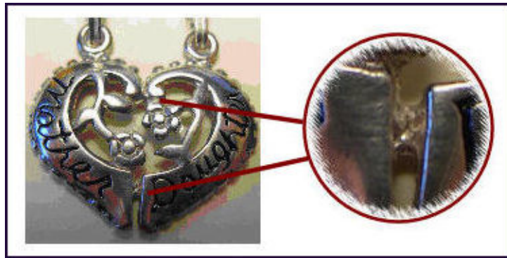
Figure 1. Filaments between pieces

As the pendant is solid sterling silver and the pieces are joined with a very small filament of silver, you should be able simply to bend the pieces with your hands to separate them. You can see the filaments in figure 1 below.